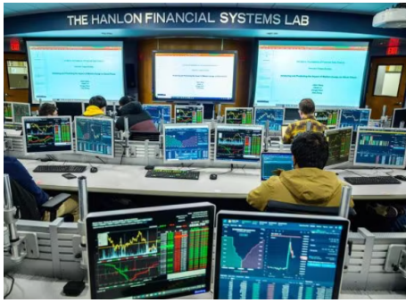
Finance Programs Industry Panel