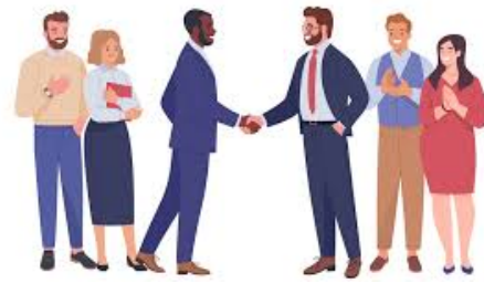
Recently onboarded HFSC assistants and their experience so far